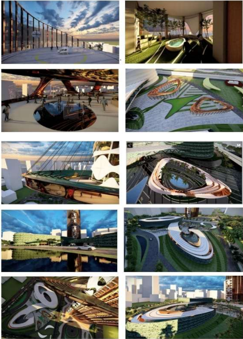
TOPIC – MIXED USE SKYSCAPER GUIDE – AR. ADITI