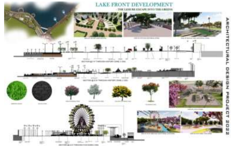
TOPIC – LAKE FRONT DEVELOPMENT GUIDE – AR. FARIDA