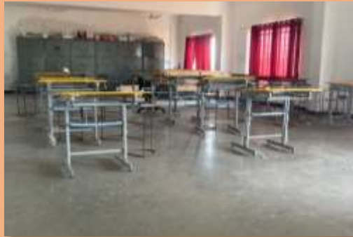
GOOD AND SPACIOUS STUDIO FOR STUDENTS

Call us on : +91 - 9448120303 , +91 – 9739691111 Website : http://sharnbasvauniversity.edu.in/