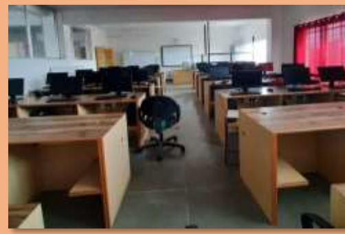
COMPUTER LAB WITH ADVANCED AND NEW SOFTWARES