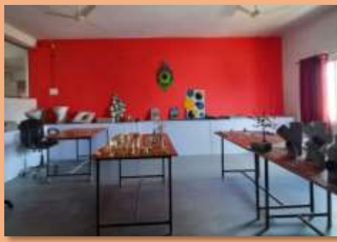
MATERIAL MUSEUM WITH ADVANCED AND CONSTRUCTION MATERIALS