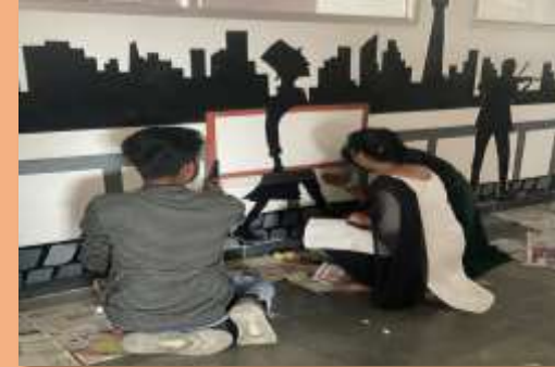
STUDENTS PARTICIPATING IN EXTRA CURRICULAR ACTIVITIES