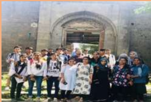
SITE VISITS AND CASE STUDY