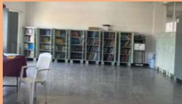
LIBRARY WITH FULL FLEDGE BOOKS